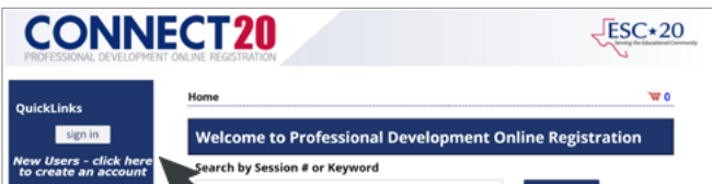
Fig 2. New Users create account page